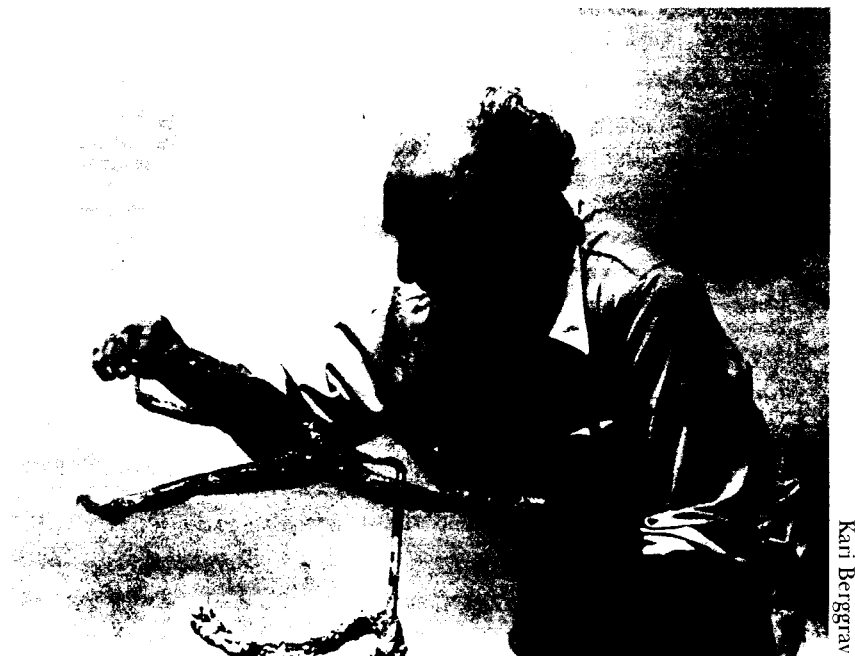
Wilhelm Reich working on “Man Leaping the Gap”