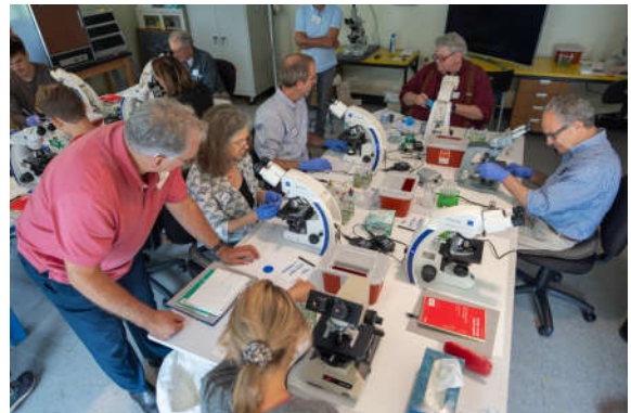
Students working at the 2024 ACO Lab Course

In September, the ACO reopened its laboratory to the public for the first time since the COVID-19 pandemic. Twelve students participated in a hands-on laboratory course where they observed and subsequently performed the Reich Blood Test. After preparing and observing bions made from organic and inorganic materials, the students familiarized themselves with the microscopes and then conducted a Reich Blood Test on themselves under faculty supervision. Additionally, a blood test was conducted on a volunteer undergoing cancer treatment. Faculty and students concurred that it was an exceptional experience, and the College anticipates conducting its next laboratory course in the new year.